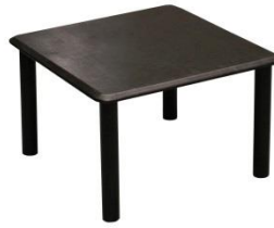
Black Coffee Table MT03 610W x 610D x 395H mm