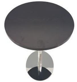
Black Round Table w/ Prong Leg MT07 800D x 760H mm