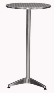
Aluminium Bistro Table BT01A 600D x 1150H mm