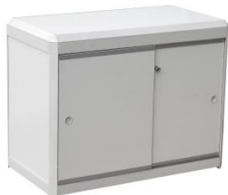
Lockable Cupboard PX03 975Wx520Dx760Hmm