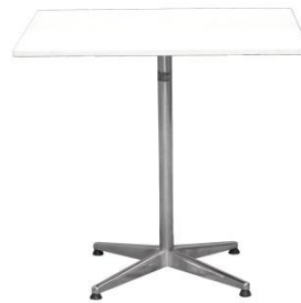
Square Table w/ Prong Leg MT06A 800Wx800Dx760Hmm