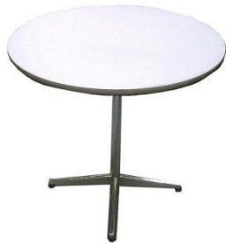
White Round Table w/ Prong Leg MT08 800D x 760H mm