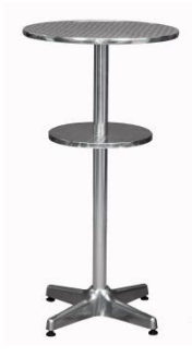
2-Tier Bistro Table BT02 600D x 1150H mm