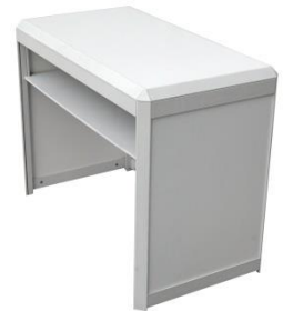
Information Counter PX01 975Wx520Dx760Hmm