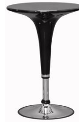
Bistro Table BT07 Max: 600Øx860Hmm Min: 600Øx710Hmm