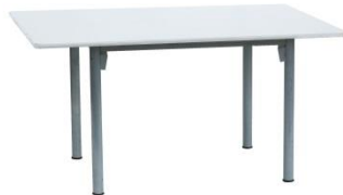
Conference Table PX07 1500Wx800Dx720Hmm