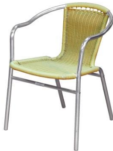
Café Chair MC17C 570Wx 720D x 740Hmm