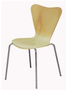
Bentwood Chair MC16 490L x 610W x 830H mm