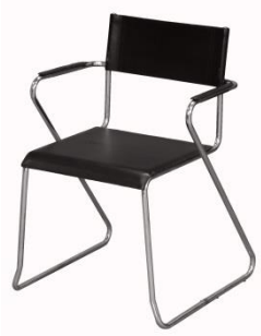
Kelvin Chair w/ Arm CC05 570W x 440D x 800H mm