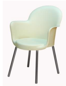
Gogo Chair MC20 590W x 590D x 840H mm