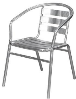
Aluminium Chair w/ Arm MC17A 570Wx570Dx740Hmm