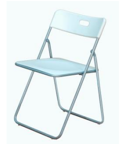
White Folding Chair EC08 460W x 400D x 455H mm