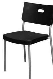
Multi-purpose Side Chair MC10A 450W x 440D x 760H mm