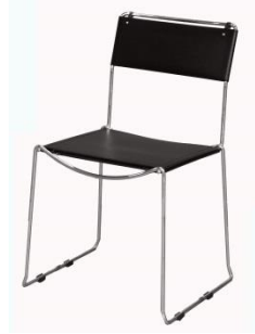
German Chair w/o Arm CC07 540W x 520D x 830H mm