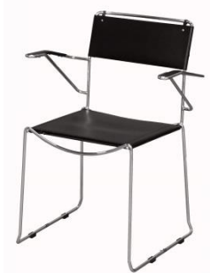
German Chair w/ Arm CC06 540W x 520D x 830H mm