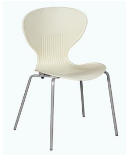
Curved Chair MC16 (W) 450Wx460Dx830Hmm