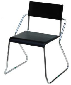
Black Leather Chair CC08 570Wx440Dx800Hmm