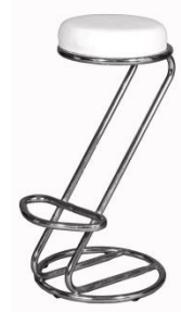
Counter Barstool BS11E (White/Black) 360W x 540D x 730H mm