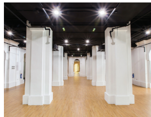
Gallery I $2,250 / 4hrs $1,500 / day †