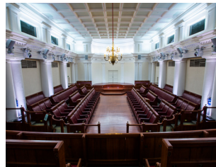
Chamber † $2,500 / 4hrs