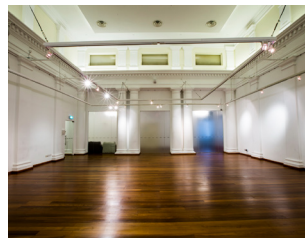
Gallery II $1,900 / 4hrs $1,000 / day †