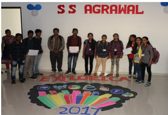
[A view of Prize Winners with Certificates]