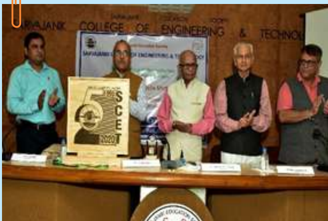
SILVER JUBILEE CELEBRATION OF SARVAJANIK COLLEGE OF ENGINEERING & TECHNOLOGY ON 02.08.2019