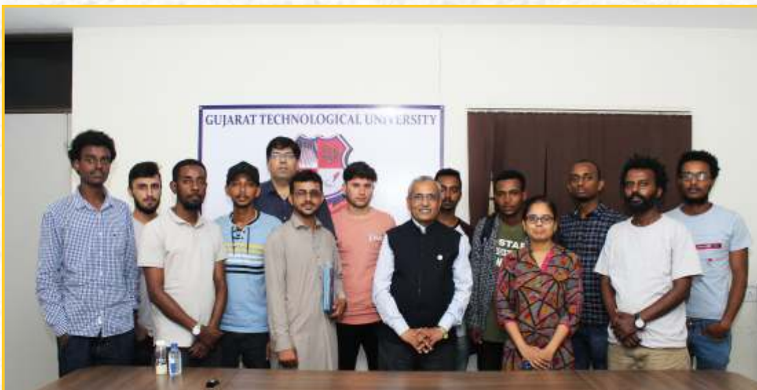
A group of International Students enrolled in AY 19-20

Welcome to the 7 th Batch of International Students (AY 2019-20) by Hon. Vice Chancellor