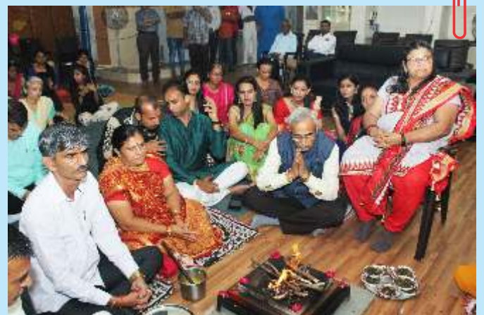
GAYATRI HAVAN AT GTU GANDHINAGAR CAMPUS