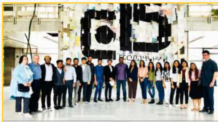
Group of B.Arch. Students with mentor