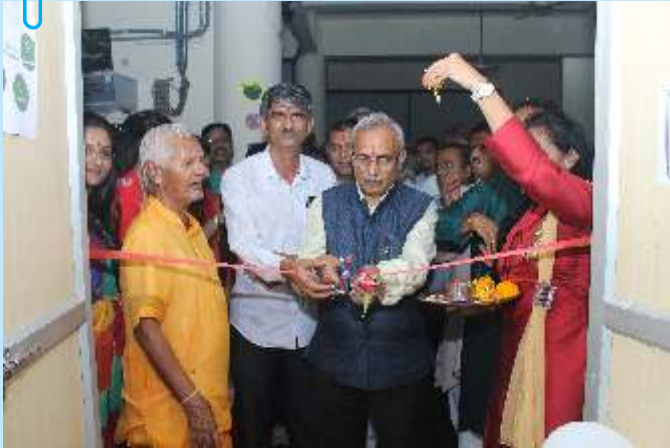
INAUGURATION OF PHARMACY LAB