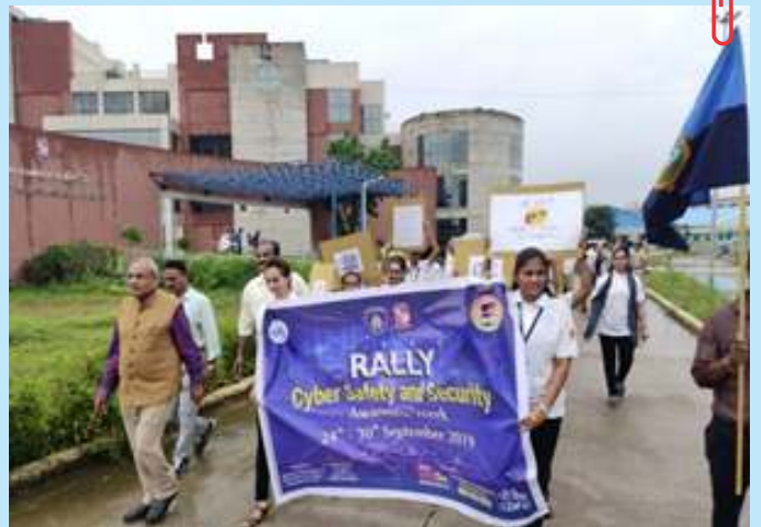
CYBER SAFETY AND SECURITY AWARENESS