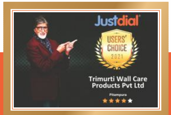
Users Choice 2021 Just Dial