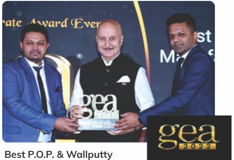
Best P.O.P. & Wallputty Manufacturer in North India Global Excellence Awards 2022