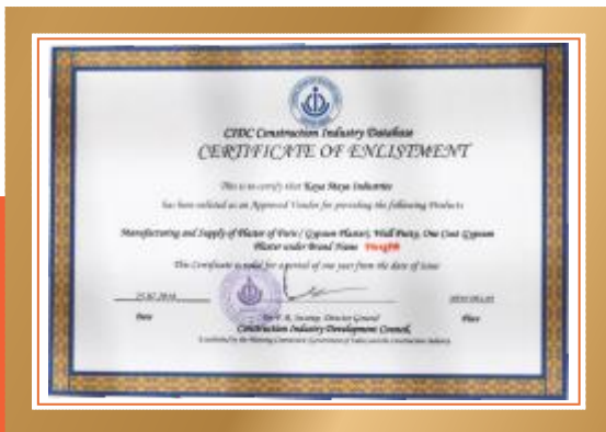
Certificate of Enlistment Construction Industry Development Council