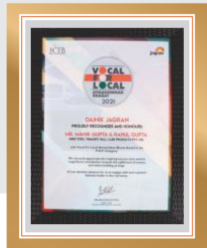
Local For Vocal Atmanirbhar Bharat 2021 Dainik Jagran