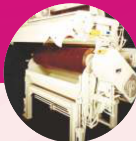
Easy Access for Saw Mandrel Inspection