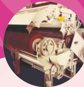
Easy Saw Mandrel Ejection