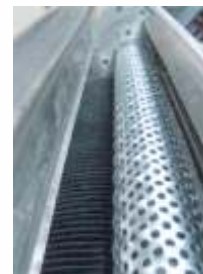
Seed Roll Tube & Conveyor