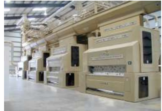
BAJAJ CONEAGLE EagleMax 201 Gin Stand and BAJAJ CONEAGLE 9120 Feeder