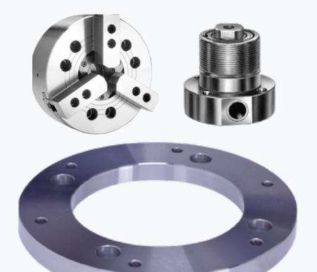
Back Plate & Coolant Nozzle