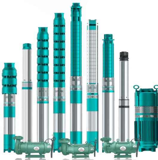
SUBMERCIBLE & SURFACE PUMPS