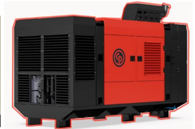
Cp CHICAGO PNEUMATIC