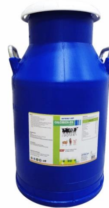
Concentrated Calcium Health Tonic

Customizable – Can be Tailormade To Your Requirements