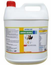
Amino Acid - Enzymes - Vits & Minerals

Customizable – Can be Tailormade To Your Requirements