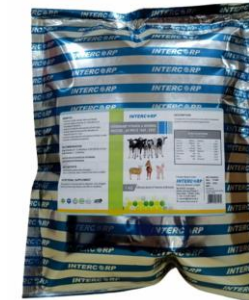
Veterinary Vitamin & Mineral Mixture