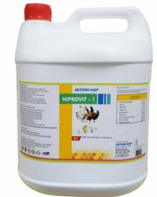
Protein - Iron - Vit Concentrate

Customizable – Can be Tailormade To Your Requirements