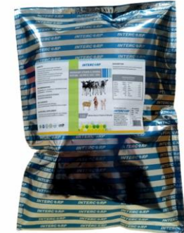
Veterinary Vitamin & Mineral Mixture