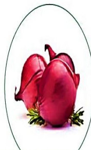
FRESH CROP RED ONION

COLOR : DARK RED/ LIGHT RED & WHITE/LIGHT YELLOW ONION