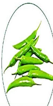
FRESH GREEN CHILLY

PACKING : 5 TO 50 KG RED MESH BAG AND JUTE BAG.