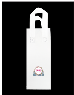
Front Cooler Bag