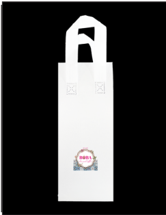
Front Cooler Bag