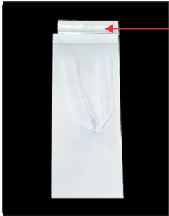
Back Cooler Bag