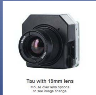
Tau with 19mm lens Mouse over lens options to see image change