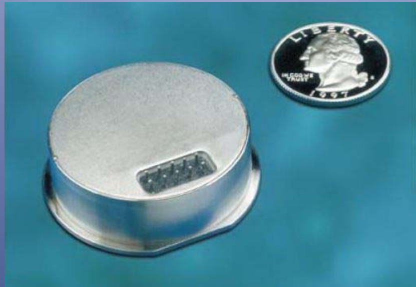
QRS11 Angular Rate Sensor– ITAR