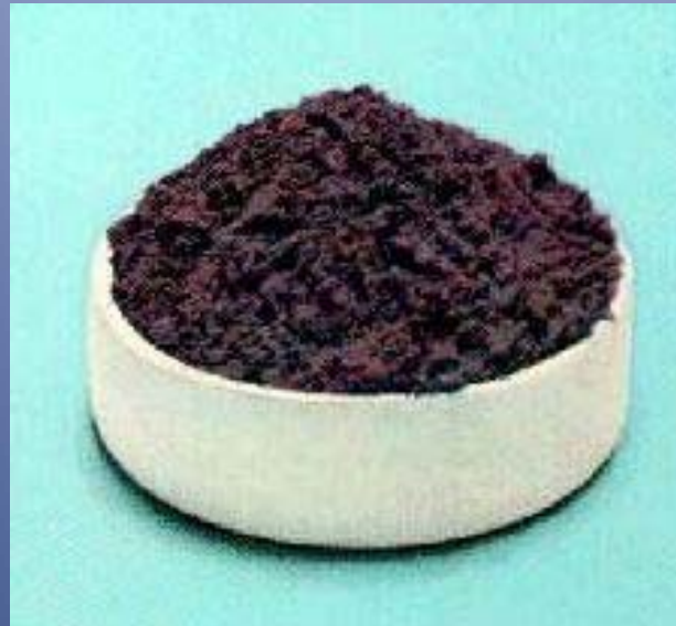
Boron powder– ECCN 1C011