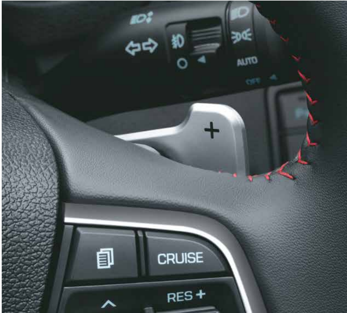
Paddle shifters (turbo)

The spirited new VERNA is not just all looks. Pop open the hood and you'll know what it's all about. With exciting new engine variants, transmission options and brand new paddle shifters (turbo), experience the power of the spirited new VERNA as you charge ahead and take control of the city roads.