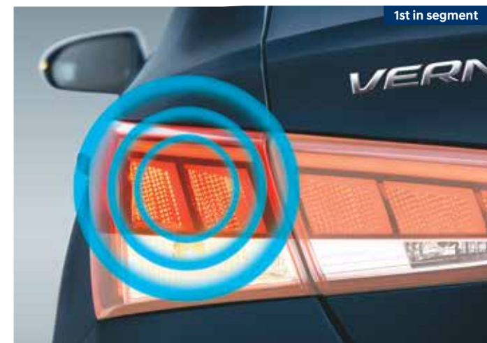
Emergency stop signal (ESS)

Other features: Speed sensing auto door lock | Impact sensing auto door unlock | Strong body structure 73% (AHSS + HSS) | Rear parking camera with dynamic guidelines | Headlamp escort function | Automatic headlamps | Vehicle stability management (VSM) | Electronic stability control (ESC) | Hill start assist control (HAC)