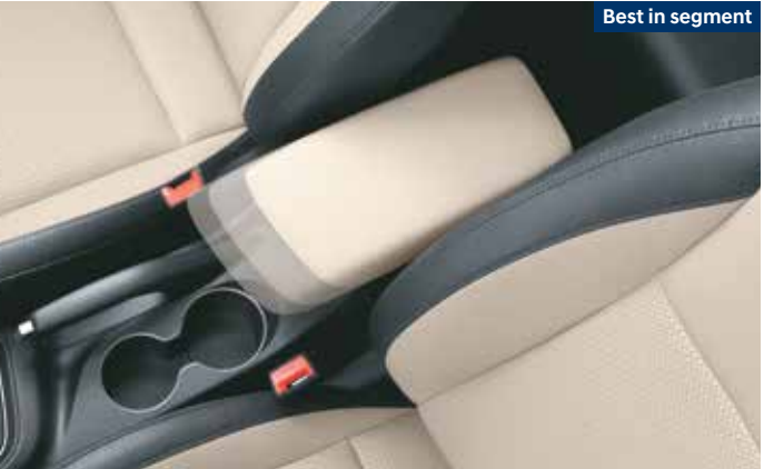
Sliding front centre console armrest with storage

Other features: Leather* upholstery | Rear centre armrest with cup holder | Rear manual curtain | Leather* wrapped steering wheel Leather# wrapped gear knob