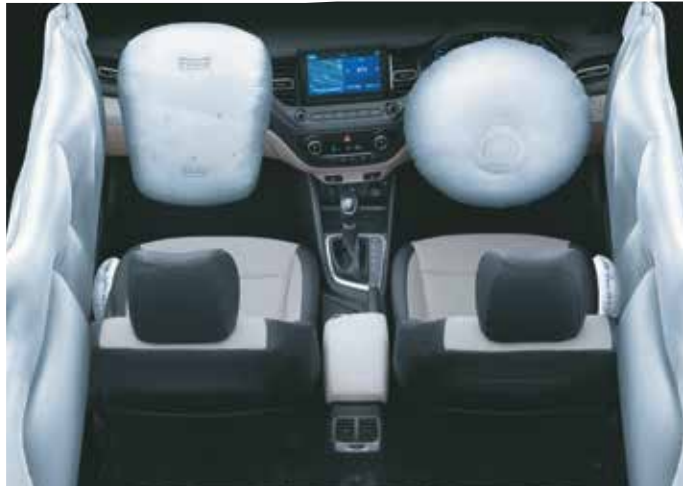
6 airbags (driver, passenger, front side & curtain)