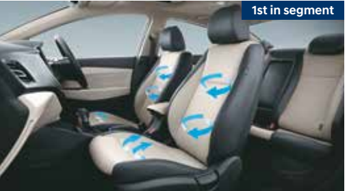
Front ventilated seats