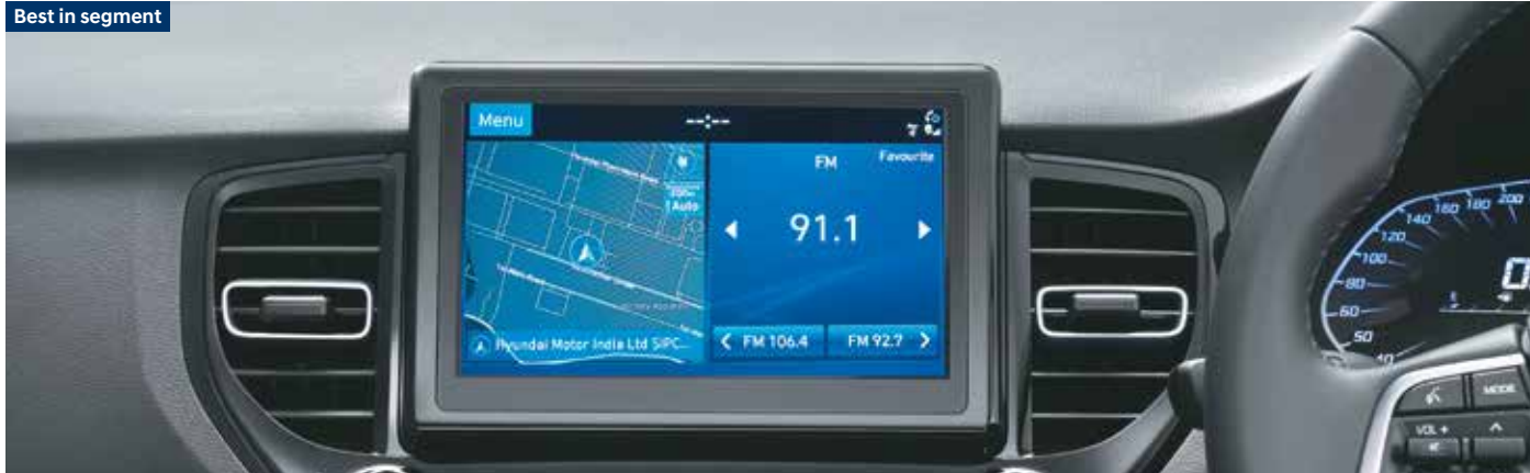
Best in segment 20.32 cm touchscreen AVNT with HD display