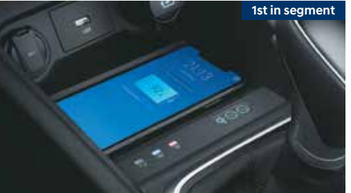
Wireless phone charger^