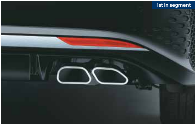
Twin tip muffler (turbo)