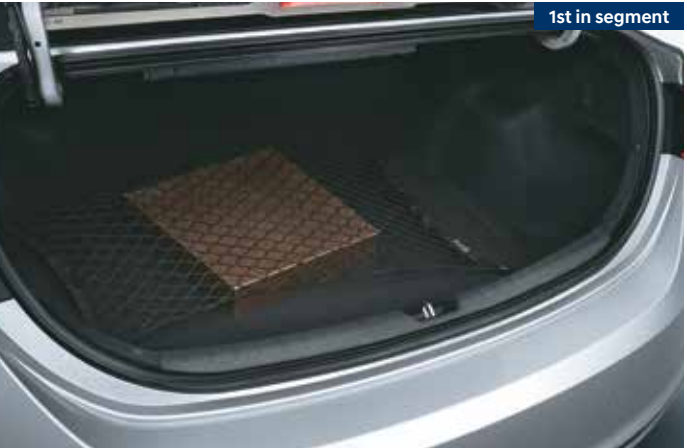
Luggage hook & net