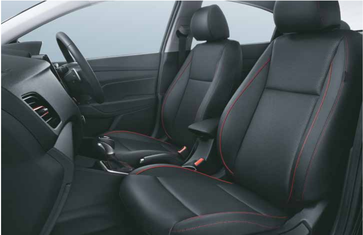
All black interiors with red accents (turbo)

Experience the touch of finesse every time you take a seat in the spirited new VERNA. The new premium dual tone beige & black interiors and all black interiors with red accents (turbo) lend a classy vibe to the cabin, designed to match your killer instinct.