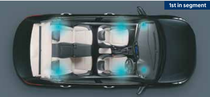
1st in segment Arkamys premium sound with front tweeters, front & rear speakers

Blue Link features: Hello Blue Link | Remote engine start/stop** | Remote climate control (AC) with engine start** | Cricket scores Push maps by Blue Link connect centre | Tyre pressure information | SOS/emergency assistance | RSA (Road side assistance) Interactive voice recognition | Fuel level information | Dial by number | Indian holidays information | Remote door lock/unlock