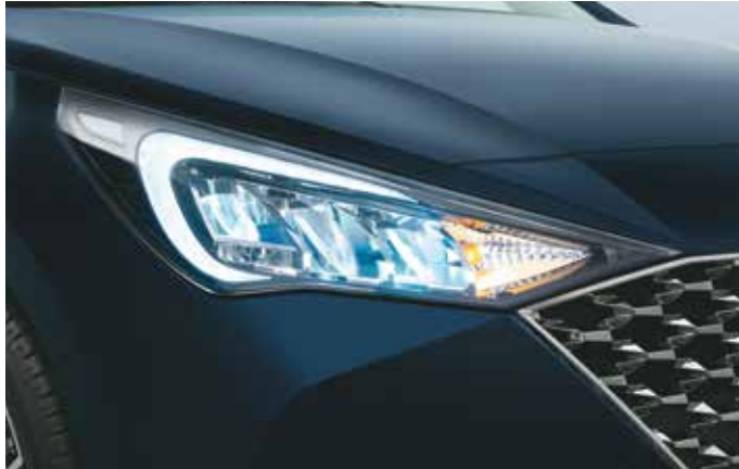
Full LED headlamps