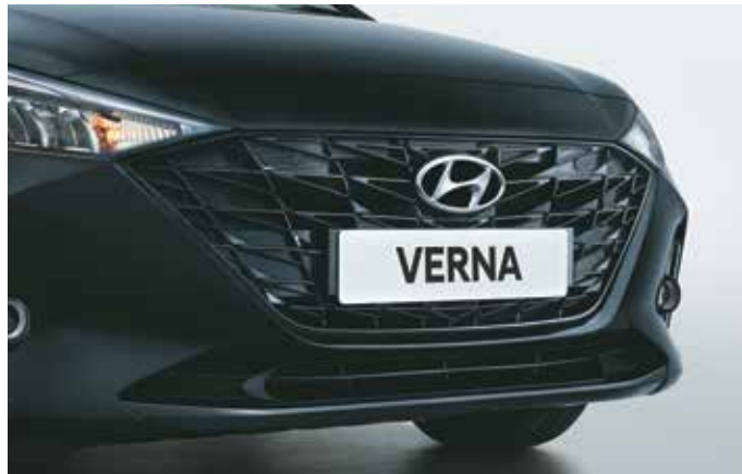
Glossy black front radiator grille (turbo)