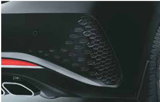
Sporty bumper design (turbo)