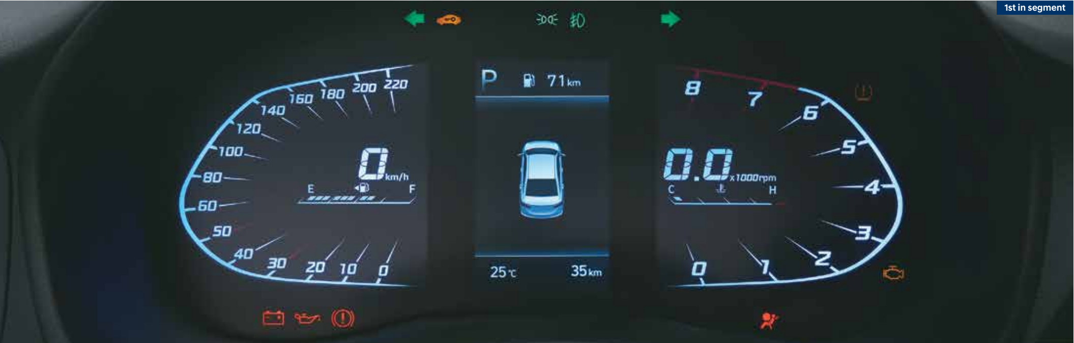
Digital cluster with 10.67 cm colour TFT MID

The spirited new VERNA has a ton of features customised to satisfy all your needs. The ingenious new smart trunk to pack all that you love without putting a finger on the boot. Front ventilated seats to keep you cool even in the hot Indian summer. An electric sunroof and a wireless charger to maximise quality time while travelling.