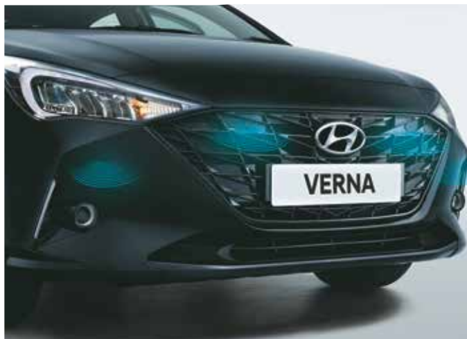
Front parking sensors (turbo)