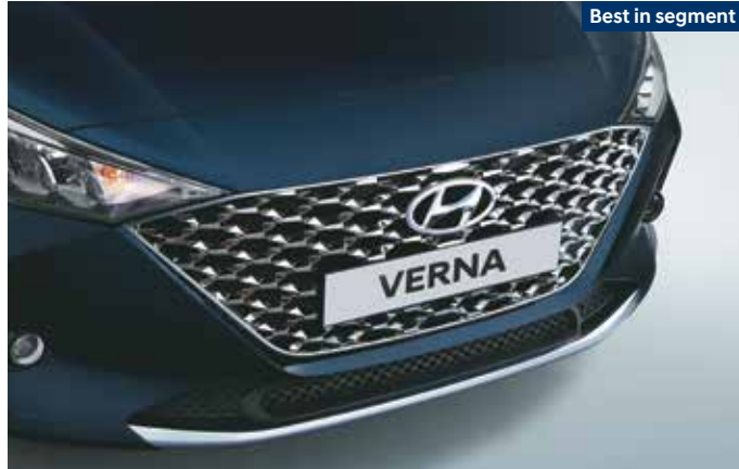
Dark chrome front radiator grille

Take a walk around the spirited new VERNA and be charmed by its exquisitely crafted sensuous sporty design and mesmerising front grille. Observe its new full LED headlamps, LED tail lamps and the twin tip muffler (turbo). Let its sporty R16 diamond cut alloy wheels sweep you off your feet.