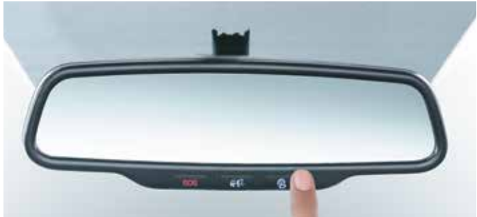
Electro chromic mirror - IRVM with Blue Link switches