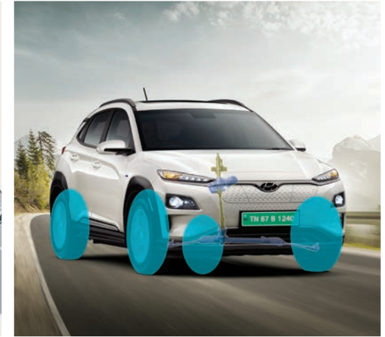
Vehicle stability management (VSM)