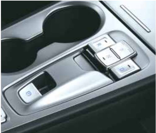
Shift-by-wire automatic transmission and electric parking brake

The second you get into KONA Electric, you enter the heart of unmatched comfort. Intelligently placed button type shift-by-wire system, impeccably designed bridge-type centre console; everything has been designed and positioned to make your driving experience as smooth as possible.