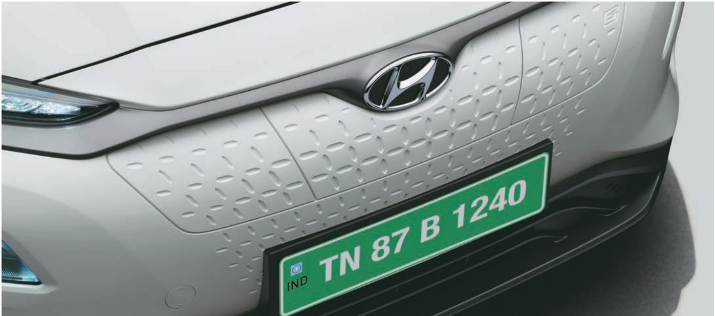
Modern, clean & integrated front grille design optimized for superior aerodynamics