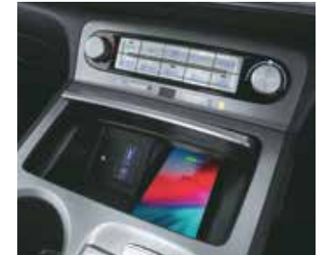
Wireless phone charger