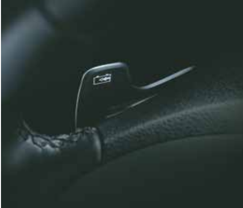
One pedal driving