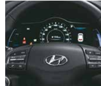
Digital instrument cluster with supervision