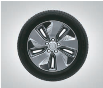
R17 (Diameter-436.6 mm) EV exclusive alloy wheels