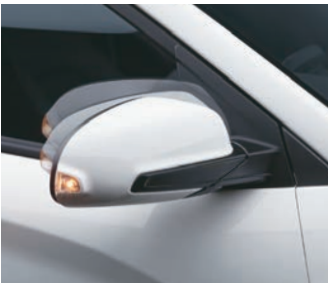
ORVM (heated) with electric adjust and folding