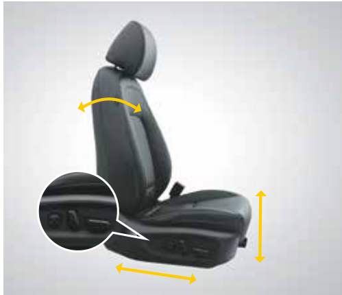
10-way power driver seat with lumbar support