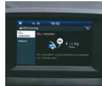
ECO driving information