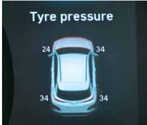
Tyre pressure monitoring system (high line)