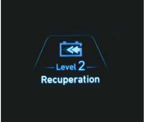
Paddle shifters (for regenerative braking)