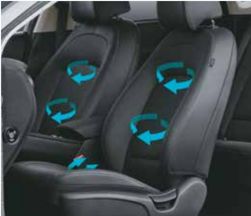
Front ventilated and heated seats