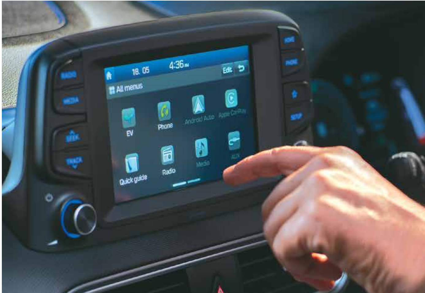
17.7cm Touchscreen Display Audio with Android Auto and Apple CarPlay screen

Get ready for a hassle-free life with KONA Electric that has been created to fit in your world seamlessly. Now you can access your phone, your favourite music and maps, using the multimedia touchscreen display that comes with Apple CarPlay and Android Auto compatibility. To ensure your phone never runs out of battery, there is a wireless charging pad.