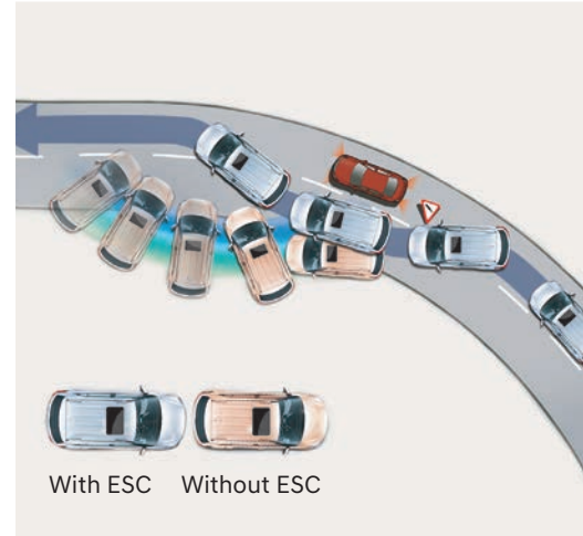
Electronic stability control (ESC)