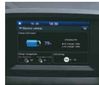
EV menu screens