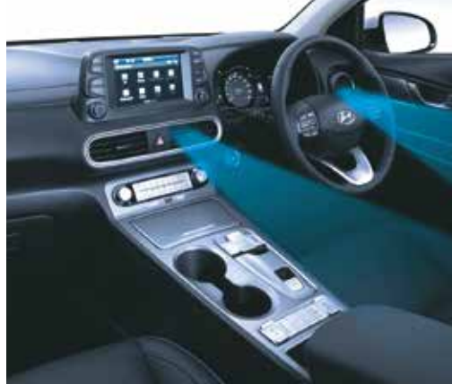
Option of driver only air conditioning

Other features: Bridge-type centre console | Leather wrapped steering wheel | LED luggage lamp Leather seats | Rear adjustable headrests | Rear split seats 60:40 | Soft touch dashboard