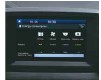
Power consumption information