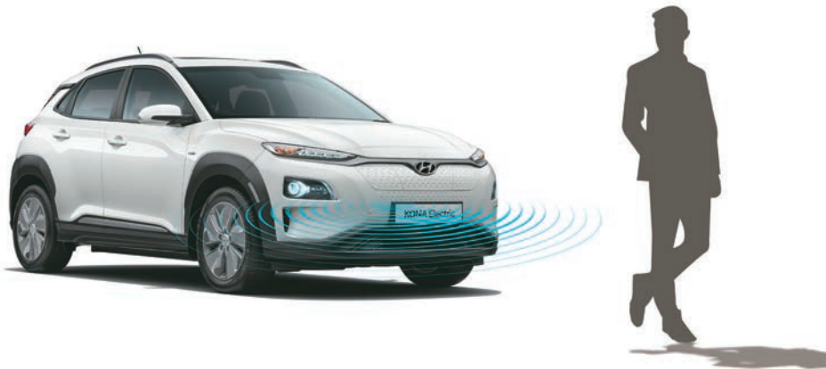
Virtual engine sound system When the vehicle is in motion, VESS generates an engine sound to ensure pedestrian safety