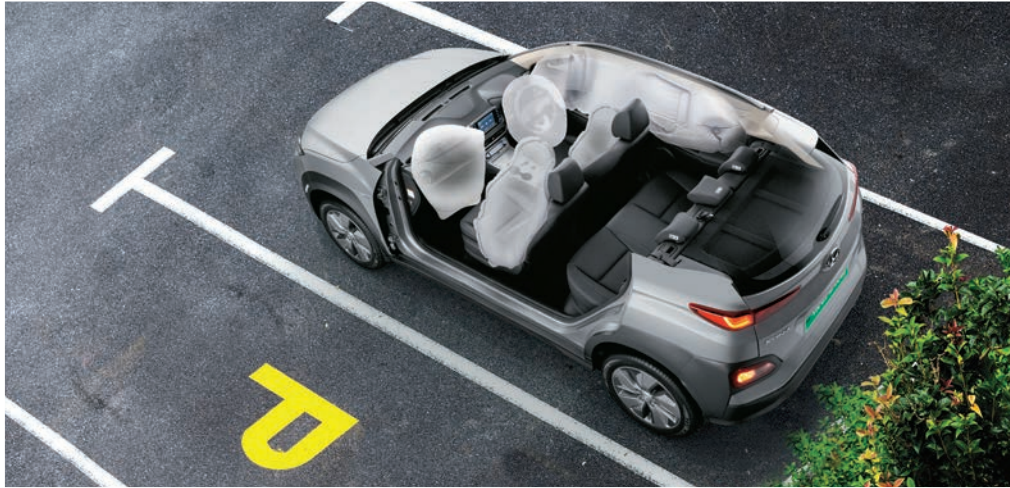
6 Airbags (driver, passenger, front side & curtain)

KONA Electric comes with superior safety features to keep you out of harm's way. Made of ultra-high tensile strength steel, KONA Electric offers high impact energy absorption that keeps the passengers safe in the unfortunate event of a collision. The cabin has been especially designed to disperse energy to reduce impact on the occupants.