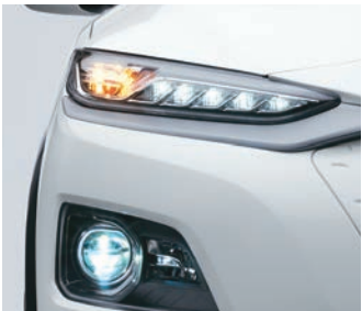
Distinctive split type LED headlamps with LED DRLs

Other features: Roof rails | Body color ORVM with turn indicators | Body colour door handles | Dual tone roof (option) | Smart electric sunroof with safety | Side sill molding – black