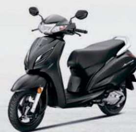
Mat Axis Grey Metallic

• +The technical specifications and design of the vehicle may vary according to the requirements and conditions without any notice • Activa meets Bharat Stage VI norms □ Product shown in the picture may vary from actual product available in the market • Accessories shown in the picture are not part of standard equipment • The technical specifications mentioned are for Smart Key variant • All features may not be part of all variants • **Conditions apply