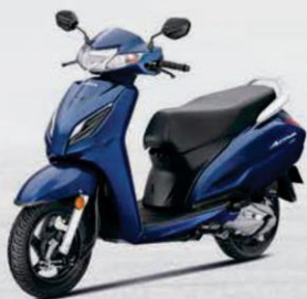
Decent Blue Metallic