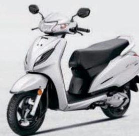
Pearl Precious White