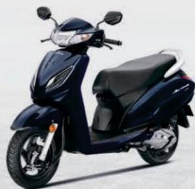
Pearl Siren Blue