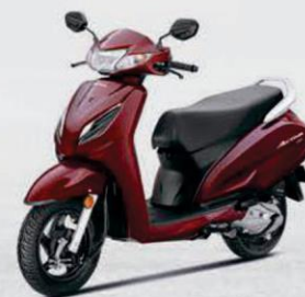
Rebel Red Metallic