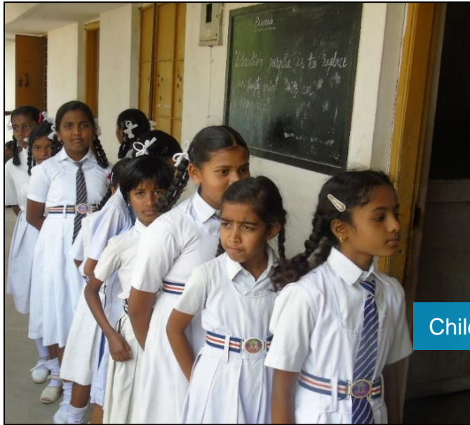
Children waiting in queue for eye screening

The Energon-BWLEH-Orbis REACH Project aims to reduce visual impairment due to uncorrected refractive errors among school-going children in all blocks of Chamrajnagar district and Doddaballapur block of Bangalore Rural district in Karnataka, India. This project is in partnership with Bangalore West Lion Super-specialty Eye Hospital and sponsored by Equis Pte Ltd. at USD50,000 per year until 2019.