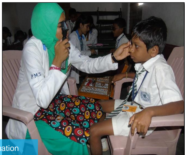
Children undergoing detailed evaluation

68,619 children were screened; 1,704 children received spectacle prescriptions while 8 children under the age of 16 received surgery.