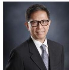
RAPHAEL P.M. LOTILLA Lead Independent Director