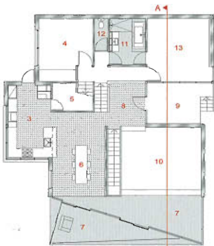
二樓平面圖 SECOND FLOOR PLAN