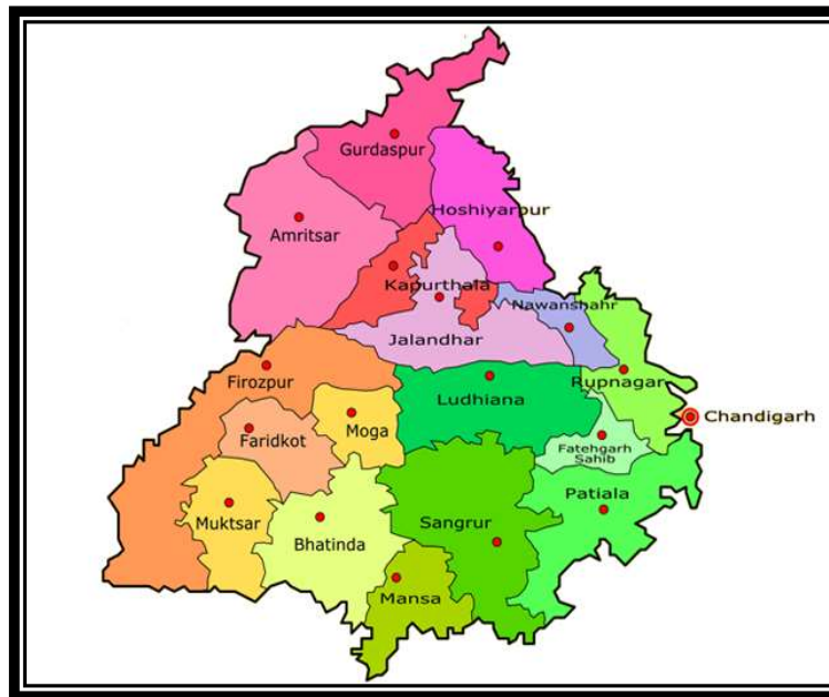
Figure – 1 Punjab State

Punjab state is North-Western State of India, bordered on the North by Jammu and Kashmir and Himachal Pradesh, on the South by Haryana, on the South- West by Rajasthan and on the west by Pakistan Country as depicted in figure 1. Punjab has been the most successful state of India with distinctive heritage. Punjab has witnessed many upheavals throughout its history. It is also called the 'Gateway of India'. Presently, Punjab has twenty districts as mentioned in table 1.